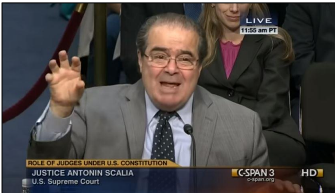
Justice Antonin Scalia (1936-2016) makes opening remarks in a briefing to the Senate Judiciary Committee, Oct 5, 2011. Scalia served on the US Supreme Court from 1986 until his death in 2016.

To help the Senate keep things in their proper perspective, Supreme Court Justice Antonin Scalia was invited to testify before the Senate Judiciary Committee in October 2011, four and a half years before he passed away. Scalia gave a brilliant recap of what sets the American form of government apart. The very structure of our government is provided by the Constitution - that's what a "constitution" actually is - Structure. It is why the U.S. has been so successful at protecting Individual Liberties, and makes the U.S. unique from every other government. It is SEPARATION of POWERS!